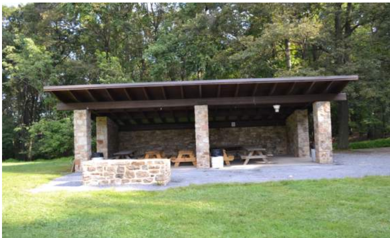
South Mountain Upper Pavilion

To check pavilion availability, you can call us at 610-865-7081. To reserve a pavilion you can come to the Parks and Recreation Office in City Hall (Rm 506) or complete the form online. Payments must be made in full when making the reservations. No refunds. Pavilions are reserved on a first come, first serve basis.